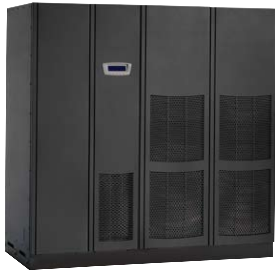
9395 UPS 550 kVA