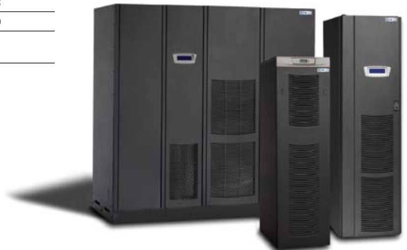
Eaton Three-Phase UPSs